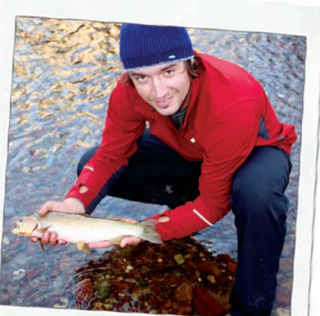
Almost always seen with a reel & rod in hand. And sometimes fish, too.