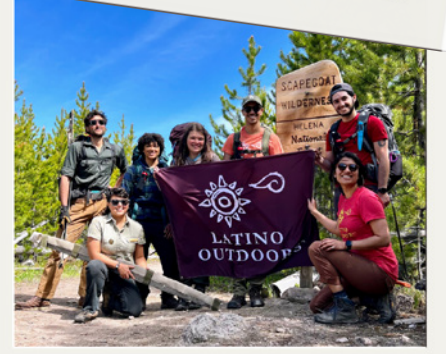
PARTNER: LATING OUTDOORS