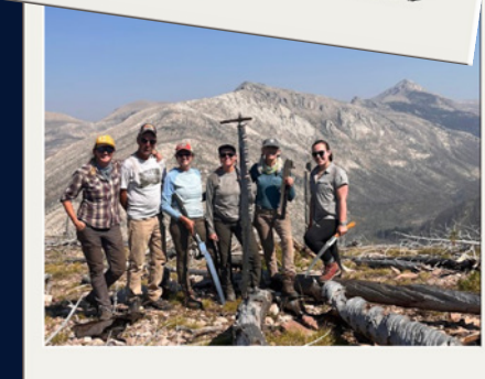
BMWF #19: GREEN FORKS

"1) The people – this crew was amazing! Despite our differences, we were all able to connect and truly enjoy each other's company. 2) Celebration s'mores on the last night of the hitch.