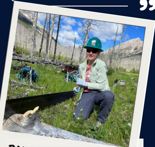
BMWF GIRLS IN THE BOB

Plenty of downtime balanced with hard, meaningful work. The triumph of sawing through a particularly large tree, the beautiful views of the Bob and meeting great folks who also love the outdoors! This was a life changing experience and I would love to do more with BMWF.