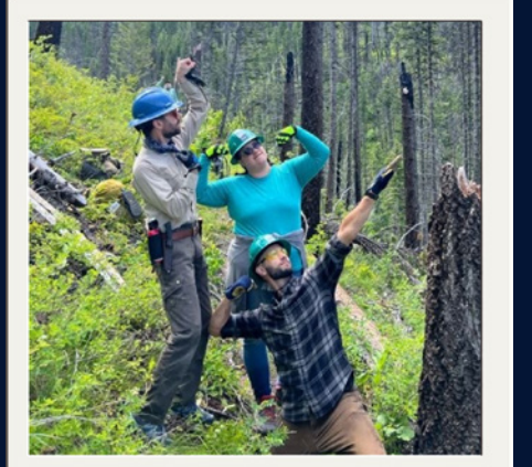
PARTNER: THE CENTER

Learning new skills in clearing trees with saws, especially the Crosscut Saw. Getting to know each other in a unique and challenging environment. Exploring the creeks, swimming in gorgeous pools and seeing a young non-threatening grizzly bear on our day off.